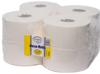
Nova Deca Rolls 1 Ply V 8 x 300M