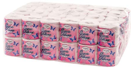
Nova T Tissue 500 SH 1 Ply Rec 48s Wrapped