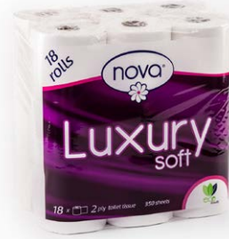
Nova T Tissue 350 SH L Soft 2 Ply V 4 x 18