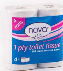
Nova T Tissue 500 SH 1 Ply Rec 12 x 4