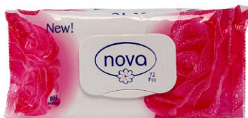
Nova Wet Wipes (24x72 Pcs)