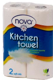
Nova Kitchen Towel 50 SH 2Ply (12x2)