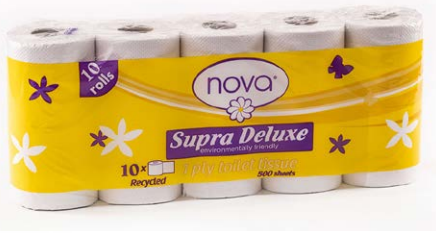
Nova T Tissue 500 SH 1 Ply Rec 6 x 10