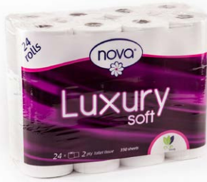
Nova T Tissue 350 SH L Soft 2 Ply V 2 x 24