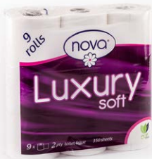
Nova T Tissue 350 SH L Soft 2 Ply V 8 x 9