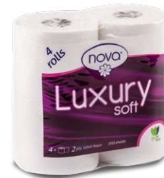
Nova T Tissue 350 SH L Soft 2 Ply V 12 x 4