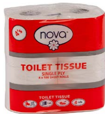
Nova T Tissue 500 SH 1 Ply V 12 x 4