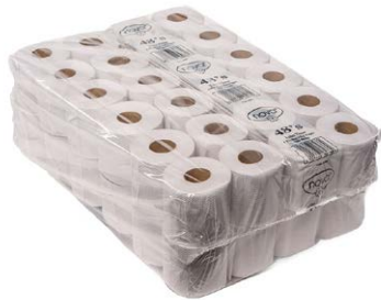
T Tissue 500 SH 1 Ply Rec 48s