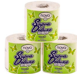
Nova T Tissue 500 SH 1 Ply V 48s Wrapped