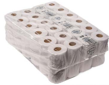
T Tissue 300 SH 1Ply Rec 48's