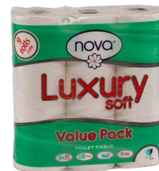
Nova T Tissue 200 SH L Soft 2 Ply V 8 x 9