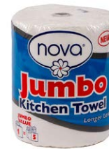
Nova Jumbo Kitchen Towel 250 SH 2 Ply