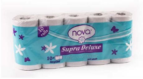
Nova T Tissue 300 SH 1Ply Rec 6 x 10