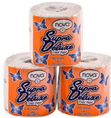
Nova T Tissue 300 SH 1P Rec 48s Wrapped