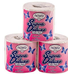
Nova T Tissue 500SH 1 Ply Rec 24s Wrapped