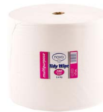
Tidy Wipe 280