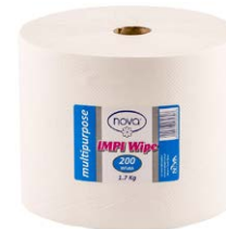
Tidy Wipe Impi