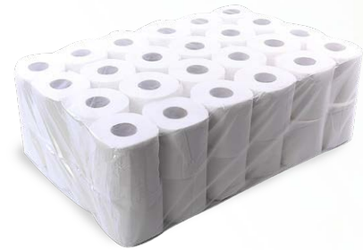
T Tissue 300 SH 1P V 48s