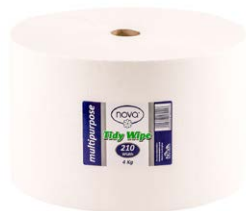
Tidy Wipe 210