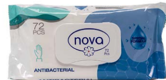
Nova Antibacterial Wet Wipes (24x72 Pcs)