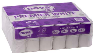
Nova T Tissue 500 SH 1Ply Premier White 48's