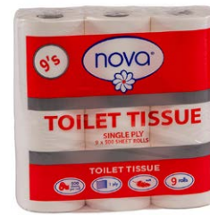
Nova T Tissue 500 SH 1 Ply V 8 x 9