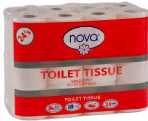
Nova T Tissue 500 SH 1 Ply V 2 x 24