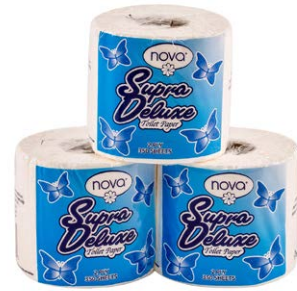
Nova T Tissue 350 SH 2 Ply V 48s Wrapped