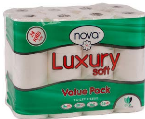
Nova T Tissue 200 SH L Soft 2 Ply V 2 x 24