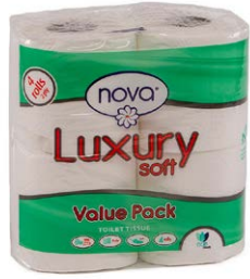
Nova T Tissue 200 SH L Soft 2 Ply V 12 x 4