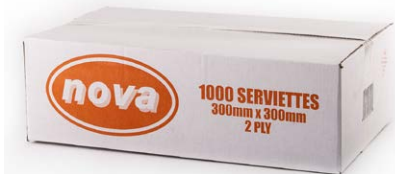
Nova Serv 2P V 300 x 300 1000's